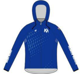
Brevet Windbreaker/ Copenhagen Inter Jacket [M323] (M324)