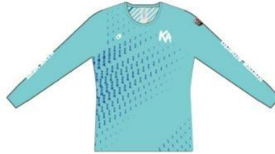
Vancouver Long Tee [M322]