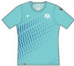
Lacarno Tee [M321]