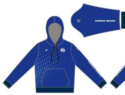
Performance Pullover Hoodie [M310]