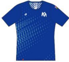
Lacarno Tee [M321]