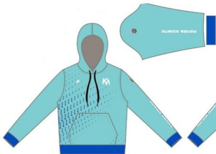
Performance Pullover Hoodie [M310]