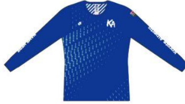
Vancouver Long Tee [M322]