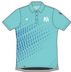
Brooklyn Polo [M325]